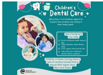
Awareness – Health Topic